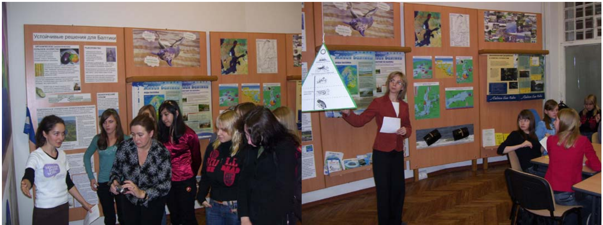
EU SE campaign INFORSE-Europe Sustainable Energy Seminar October 6-8, 2010, CAT, Wales UK