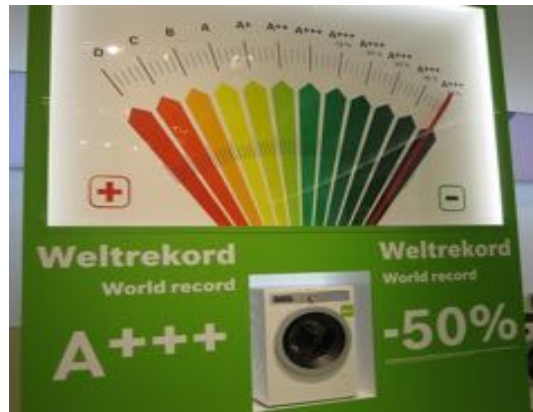
Figure 2. Energy performance declaration of washing machines beyond the A+++ class