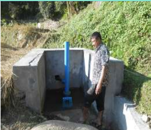
Hydraulic Ram Pump