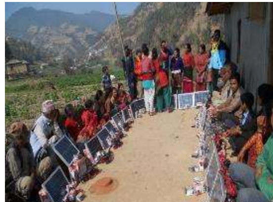
Solar PV Home System