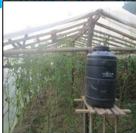
Drip Irrigation in Plastic Tunnel