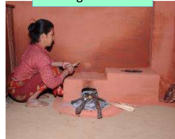
Mud Improved Cooking Stoves