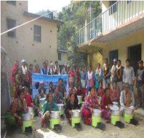
Portable Improved Cooking Stoves