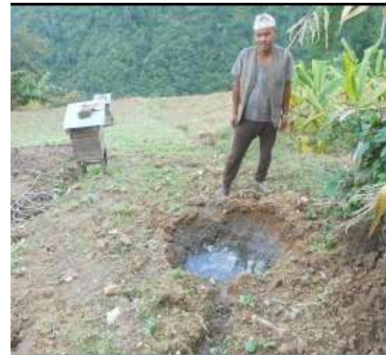
Waste Water Collection