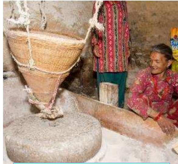
Improved Water Mill