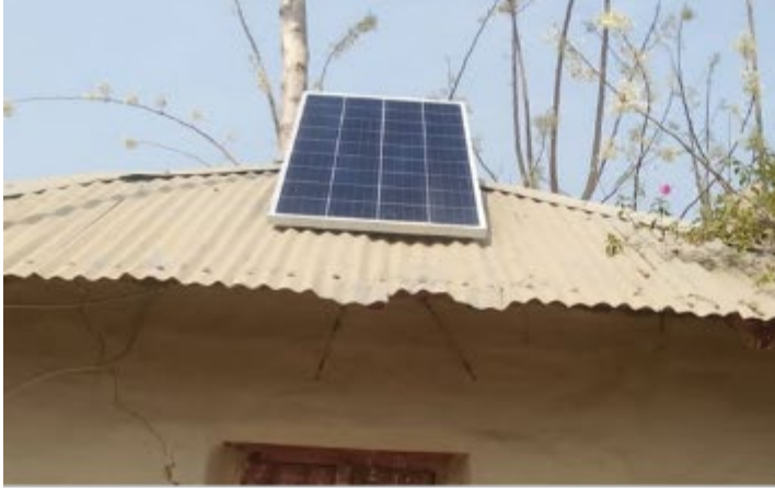
Solar Home System