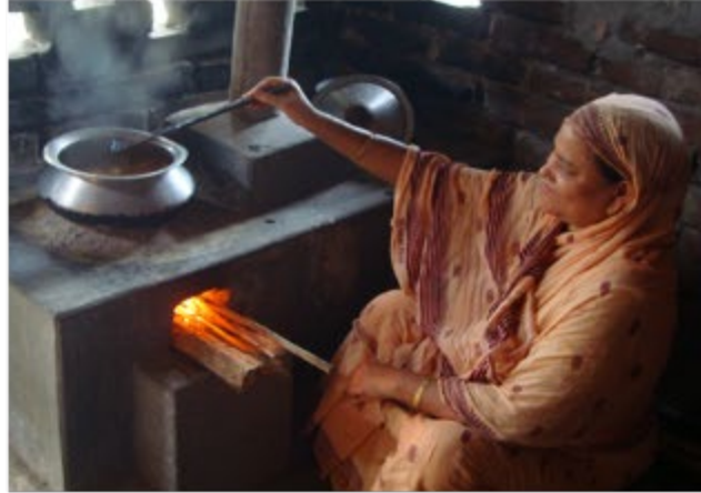
Improved Cooking Stove