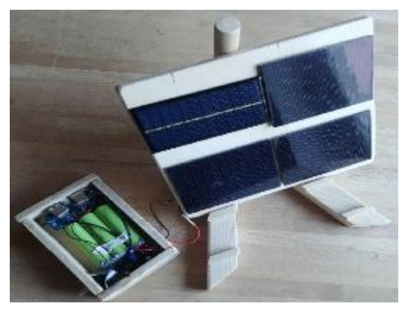
DIY Solar Power-bank