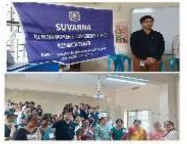
Suvarna, AIWC Kozhikode, Kerala

Awareness Programmes on Energy Conservation : Reducing energy consumption by adjusting behaviors and habits.