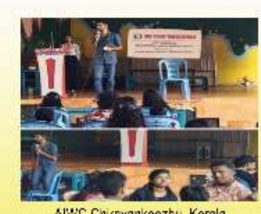
AIWC Chirayankeezhu, Kerala.

Sarojini House, 6 Bhagwan Dass Road, New Delhi 110 001 Website: www.aiwc.org.in E-mail: info@aiwc.org.in/president@aiwc.org.in