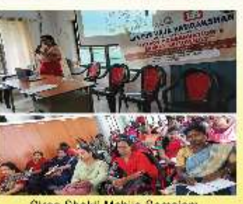
Stree Shakti Mahila Samajani, Nedumangad, Kerala