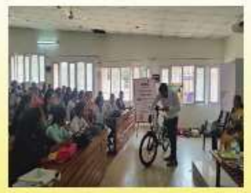
Gurgean Gramin Mahila Mandal, Haryana