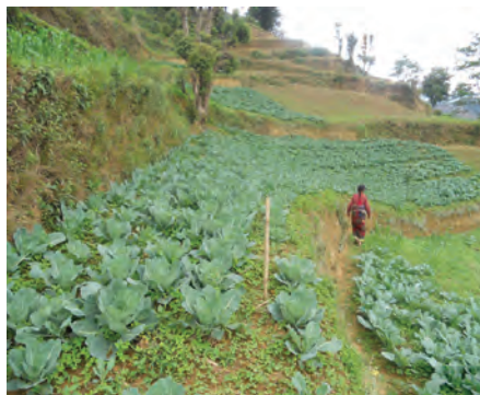
Vegetables grown by using stored waste water and rain water

He has also constructed a plastic pond, where he collects wastewater from his house. He uses micro irrigation techniques such as sprinkler irrigation to channel this collected water to his vegetable farm and fruit plantation. He reported that with the application of these technologies in his farm, he has raised the yield and also his income by NRs. 30,000 by selling vegetables.