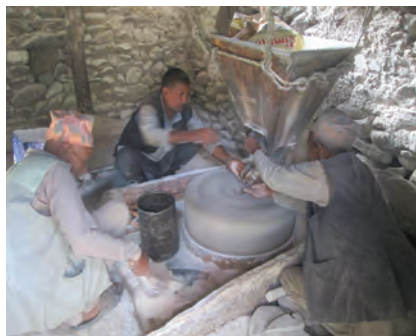
Grinding grains for customer

with an IWM. While the traditional water mill used wooden chute to support water flow, the IWM uses polyethene pipe with a nozzle attached to it at the outlet. Instead of wooden shaft and blade, the IWM uses the ones made of iron. This transformation has brought a significant improvement in Shrestha's water mill-related work efficiency. The improved technology can now grind about 30 kgs per hour of grain as opposed to 7 kgs by the old