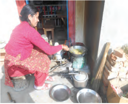
Ganga making food in metallic cookstove