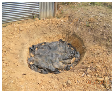
Using used water in kitchen garden using sprinkler irrigation system (left) and decomposing household waste to prepare compost in pit (right)

The Tamang family has also been producing organic fertilizer using a composting pit method that they learned about at the capacity building programme organized within the EVD project. They have been using the fertilizer generated from this method on their kitchen garden and plastic tunnel house. Similarly, the family has also dug small pit in their backyard in order to collect water used for washing hands and utensils. This was done with an intention of re-using the water to irrigate kitchen garden and plastic tunnel house. This has helped in making their surrounding clean and favourable for his bee farm. Last year, he earned about NRs. 60,000 by selling honey and he is expecting more than that this year. Since people come to his house to buy honey at NRs. 600 per kg, he does not need to go to market to sell honey.