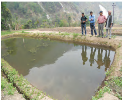
Officers from government and non-government organization observing Sanukanchhi's fishpond

The pond was constructed about a year ago. It is 5.5 m wide and 2 m high (water level is up to 1.2 m). It costs her about NRs. 30,000 to construct the pond as per the prescribed norms, including equipment cost, material cost and skilled and unskilled labour cost. Initially, about 500 Common carp and Grass carp species of fish worth NRs. 700 were released in the pond.