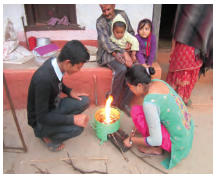
Villagers trying ICS for the first time

Almost all houses in the village were damaged, following the earthquake. Building regular fixed-type traditional stove (made of earth) was not possible due to a lack of safe and permanent place to live in and, the uncertainty that lingered in the form of aftershocks. The portable ICS became the most appropriate cooking technology when the entire village was living in temporary shelters. But villagers were sceptical about its ability to fulfil their needs the same way as traditional cookstove did. As soon as they received the improved stove, they tried by lighting it and got better result than was expected. The stove largely reduced fuel