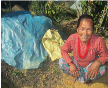
Sovit Man's wife in front of plastic pond to collect waste water (left) and solid waste turned into organic fertilizer (right)