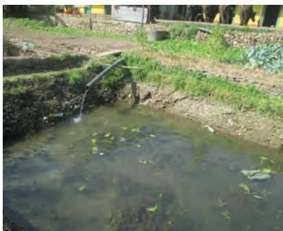
Growing fish in Sanukanchhi's fish pond