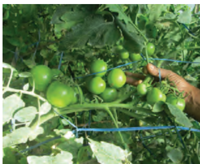
Plastic Tunnel under construction (left) and tomato production from the tunnel (right)

They also planted some off-season vegetables like cucumber in their kitchen garden to see if it grows outside the plastic tunnel or not. The production was just enough for their own consumption. They are planning to grow more next year, and are hoping to earn money from it as well. They are also growing a high value ornamental plant called " Bodhichitta " in their kitchen garden. He purchased 5 seeds at NRs. 500 per piece. This plant generally produces fruit after three years of planting and its fruit is considered sacred among the Buddhist community.