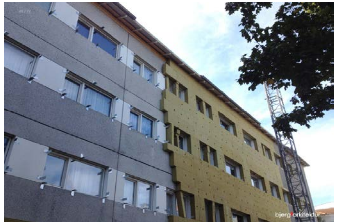
Installation of outdoor insulation