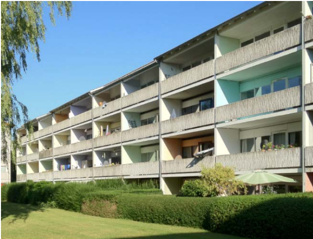
Apartment block before renovation.

The 987 apartments in the social housing "Gadehavegaard" (part of social housing association "Demoa") were built 1977 - 1982 and needed renovation. It was then decided to make a very extensive renovation to make the buildings conform with the "passive house" standard with very low energy demand (annual heating demand reduced to 15kWh/m 2 ). This included outside insulation, inclusion of balconies in heated space, windows, new/renovated ventilation and others. In this way the flats could save 85% of the heat demand and the saved heat will give savings for the inhabitants that will compensate for the payback of the extra investments.