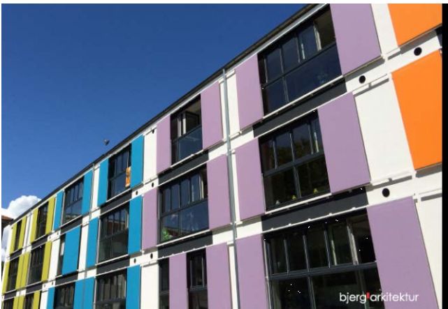
Apartment block after renovation