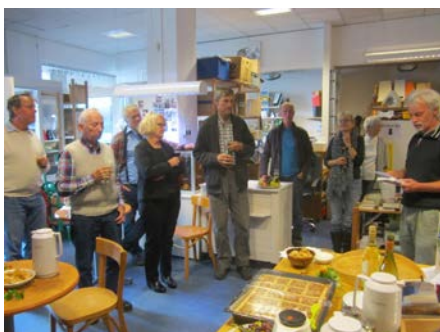
Picture from Environment and Energy Center in Høje Taastrup at a book launch, October 2015

One of the local organisations connected with the Danish NGO "SustainableEnergy" is running a center for environment, repair, reuse and sustainable energy near the Høje Taastrup railway station. In the center it is possible to get help to repair and reuse a number of household equipments, electronic devices etc. The center has also information on energy efficiency and renewable energy and organises a number of events on many aspects of green lifestyle.